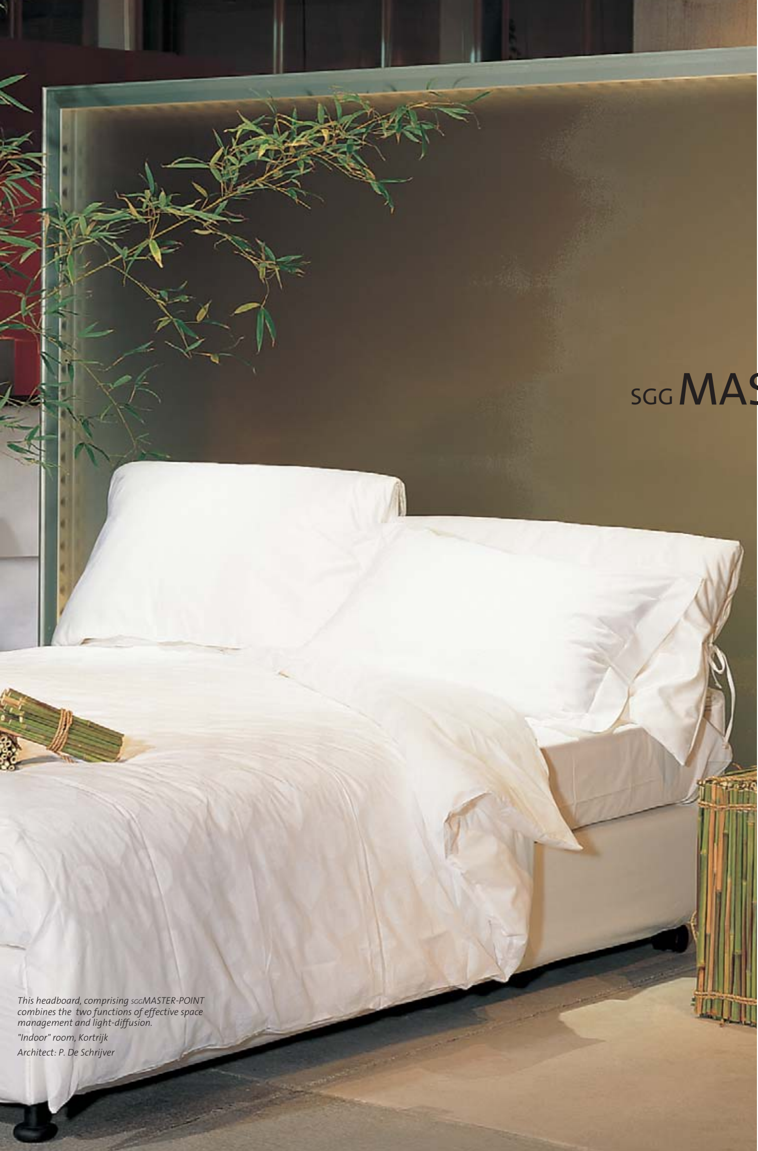
This headboard, comprising sGG MASTER-POINT combines the two functions of effective space management and light-diffusion. "Indoor" room, Kortrijk Architect: P. De Schrijver

sGG MASTERGLASS must be installed in accordance with current national safety standards and regulations. As with all textured glasses, the pattern on sGG MASTERGLASS runs in one direction. To obtain a uniform appearance, the cut sheets must be placed side by side with the pattern on the glass running in the same direction. Special care must be taken cutting the glass when continuity of the pattern is required. Please contact us regarding glazing into external applications.