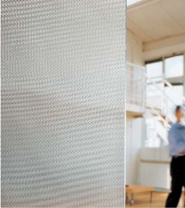
Wave-shaped doors which shimmer in the light. Anastasia Design.