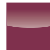
SGG 21 Opera Red