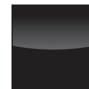
SGG 20 Black