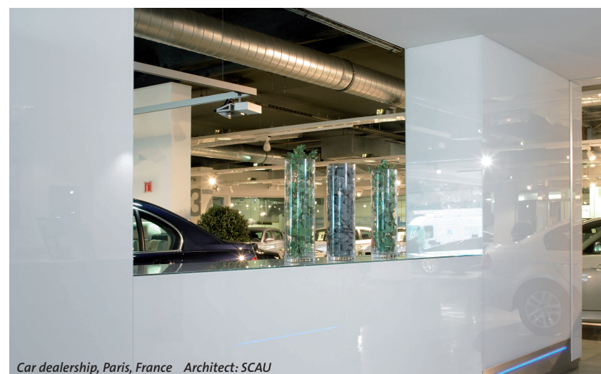
Car dealership, Paris, France Architect: SCAU