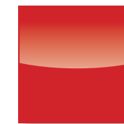
SGG 137 Flame Red