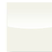
SGG 12 Extra-White