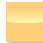
SGG 03 Solar Yellow