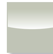
SGG 170 Light Grey