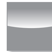
SGG 19 Titanium Grey