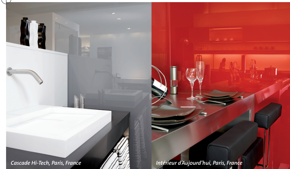
Cascade Hi-Tech, Paris, France