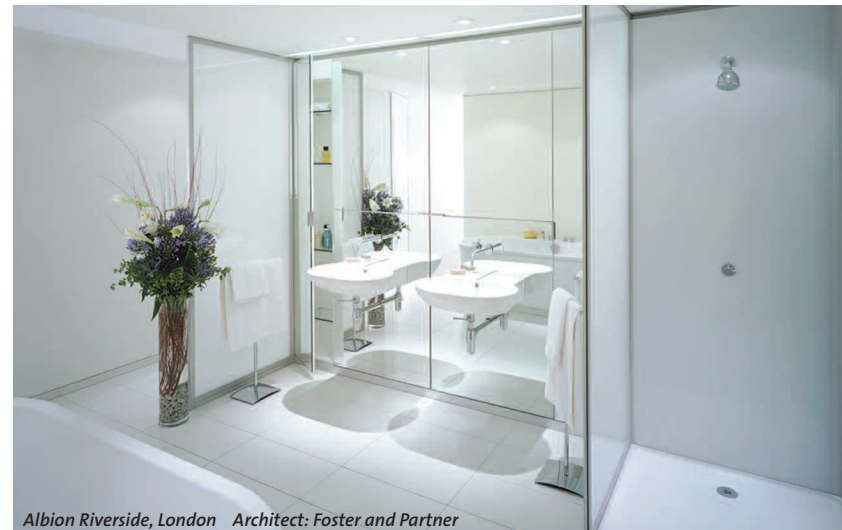
Albion Riverside, London Architect: Foster and Partner

Where the use of safety glass is required, a safety film-backed version is available, SGG PLANILAQUE EVOLUTION SAFE.