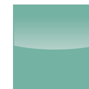
SGG 15 Mint Green