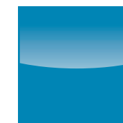
SGG 09 Aqua Blue