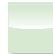
SGG 01 Almond Green