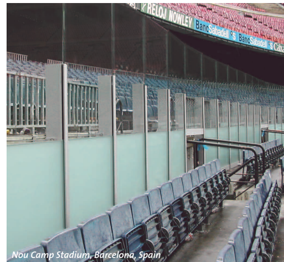
Nou Camp Stadium, Barcelona, Spain

Please refer to the documents entitled "SGG VISION-LITE Instructions for use" and "SGG VISION-LITE, Assembly, installation and maintenance".