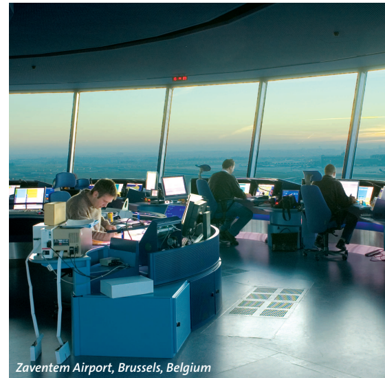
Zaventem Airport, Brussels, Belgium

The maximum dimensions of the finished product depend on the technical capabilities of the processing site.